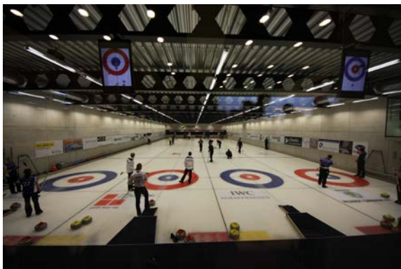
Sight from the tribune