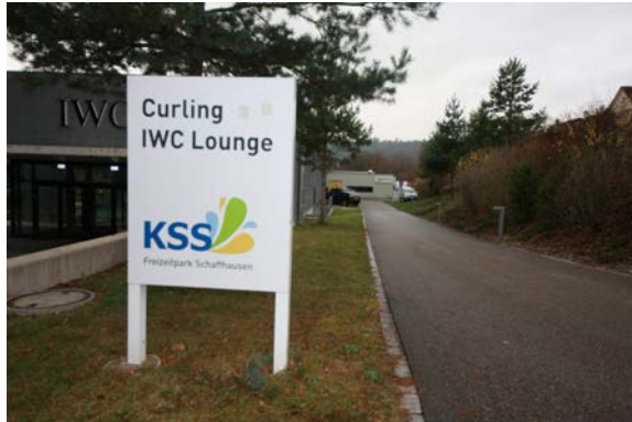
Sight towards Curlingcenter from the street