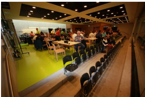
Restaurant with buffet